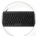
Mini USB Keyboard