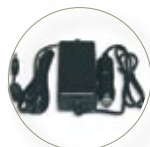
12V car Adapter